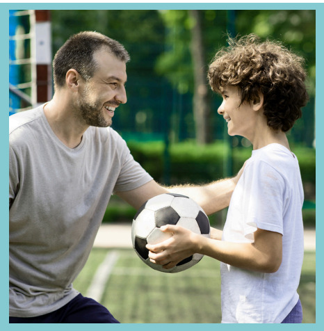
OXNARD PORT HUENEME